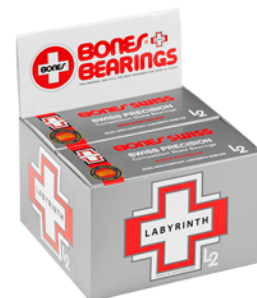
BONES SWISS LABYRINTH II 10-PACK POP BSLWB288P10