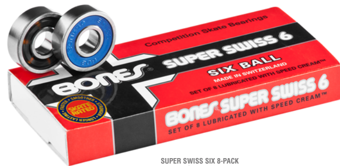
SUPER SWISS SIX 8-PACK BSAWBB68

The lowest cost of our Bones Swiss line, it still outsells all the rest.