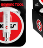
BEARING TOOL 10-PK POP ATBPP10