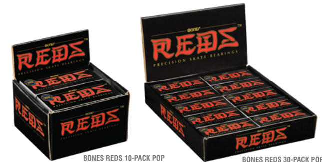
BONES REDS 10-PACK POP BSACBR88P10

Bones Race REDS are created with the same top quality materials as Bones Super REDS to make them perform well at high speeds, withstand the impacts of rough skate terrain, and outlast bearings with lesser quality materials. They are pre-lubricated with Bones Speed Cream® racing lubricant, so they are ready to ride or race.