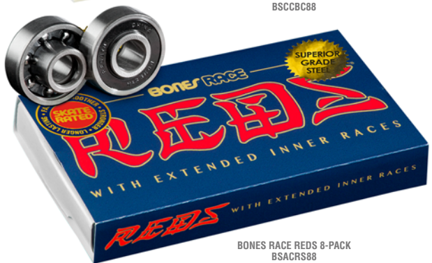
BONES RACE REDS 8-PACK BSACRS88