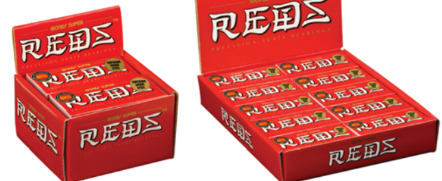
BONES SUPER REDS 10-PACK POP / BSACSR88P10