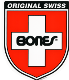
NEW BONES SWISS 15.75" SHIELD RAMP STICKER / SSBSSH16