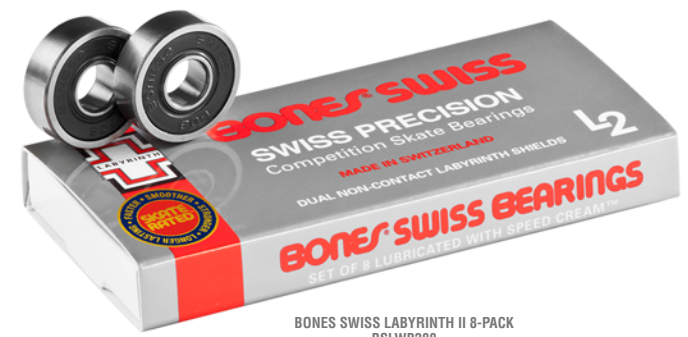
BONES SWISS LABYRINTH II 8-PACK BSLWB288

This unique design features six larger diameter balls instead of the seven balls used in most 608 bearings. The advantage of this design is higher speed, rapid acceleration, greater strength and durability. Many pool and ramp riders prefer this model.