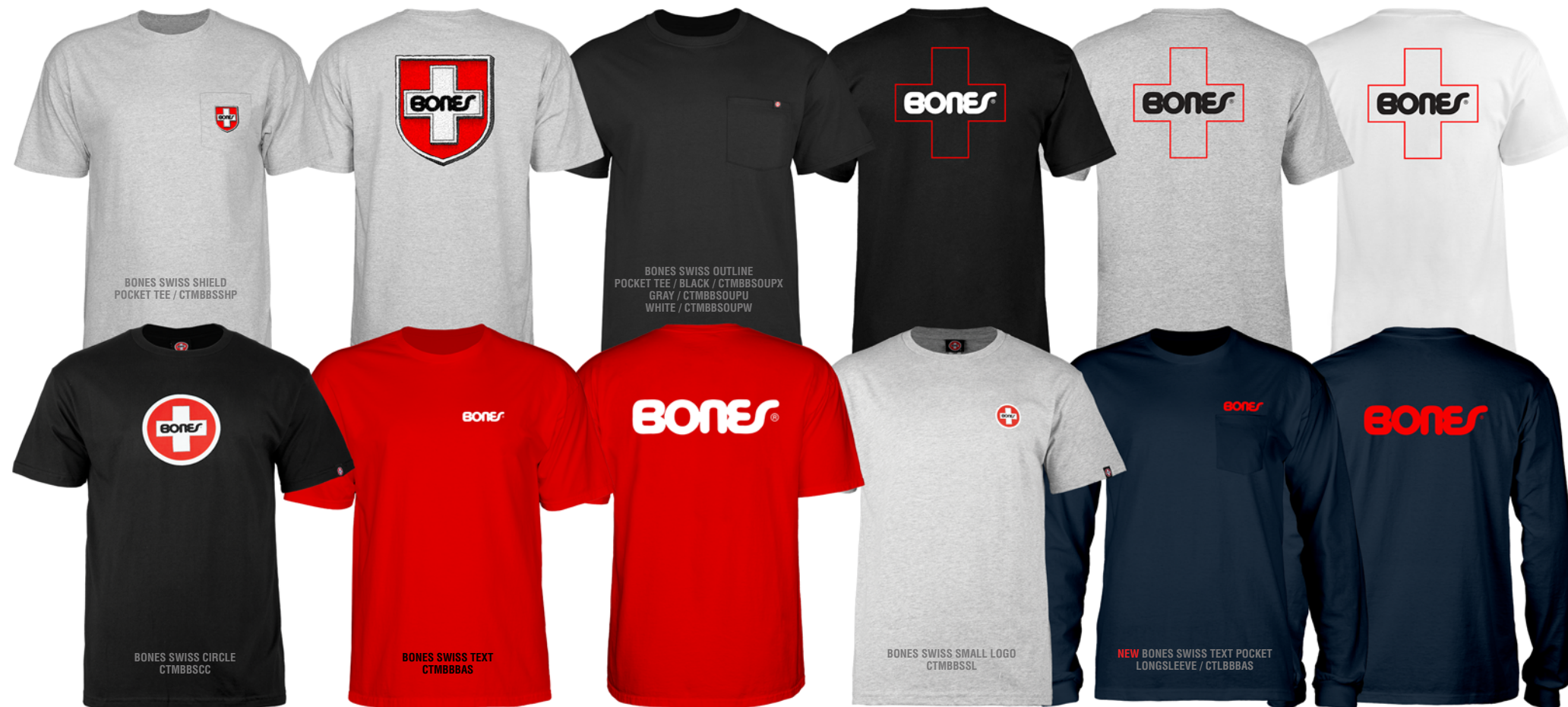
BONES SWISS SHIELD POCKET TEE / CTMBBSSH