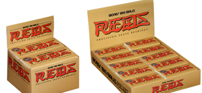
BONES BIG BALLS REDS 10-PACK POP / BSACB888P10