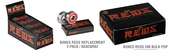
BONES REDS 30-PACK POP BSACBR88P30