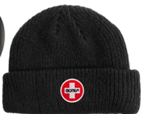
NEW BONES SWISS PATCH BEANIE BLACK / CHKASPX