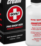
BEARING CLEANER ATBCU