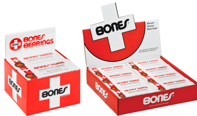
ORIGINAL BONES SWISS 10-PACK POP BSAWBX88P10

Ceramic balls create less rolling friction than steel balls and are thus faster and longer rolling, with or without lubricant! If you get dirt into your Ceramic Bones Swiss, the ceramic balls will help to re-polish the steel races flat again after cleaning, providing a self-healing feature because ceramic balls are so much harder than steel. Finally, ceramic balls will not rust, further lengthening their life.