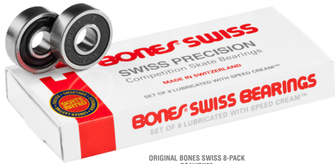
ORIGINAL BONES SWISS 8-PACK BSAWBX88