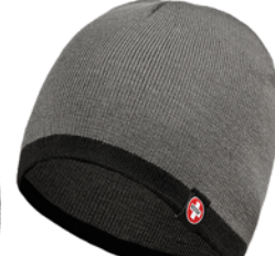
BONES SWISS LABEL KNIT BEANIE GRAY / CHKASW2