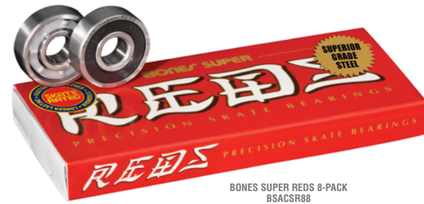
BONES SUPER REDS 8-PACK BSACSR88