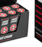
SPEED CREAM PRO SHOP 4 OZ BALSOSPDP5