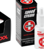
SPEED CREAM 10-PACK / BALSOSP10