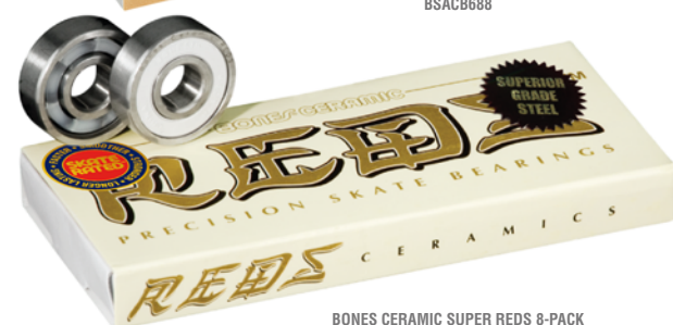
BONES CERAMIC SUPER REDS 8-PACK BSCCB888