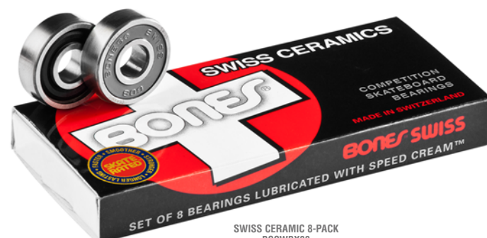
SWISS CERAMIC 8-PACK BSCWBX88

The only difference you will notice is that the L2 Swiss will last several times longer than the original Bones Swiss bearings between cleanings. This significant increase in service life comes at a very small increase in retail cost, so the value is greatly increased.