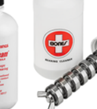
BEARING CLEANER POP ATBCUP6