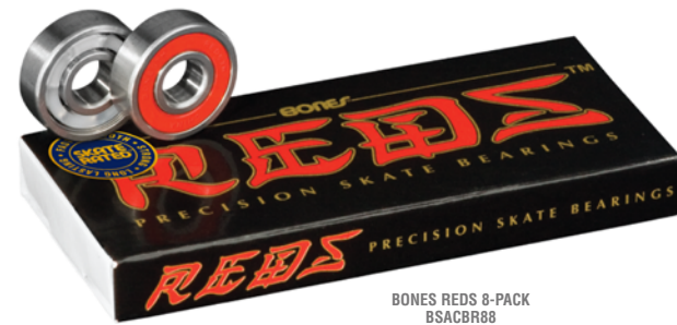
BONES REDS 8-PACK BSACBR88