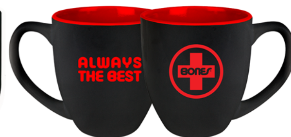
NEW BONES SWISS 16OZ MUG AHABBATB