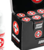
SPEED CREAM 30-PACK POP / BALSOSPDB