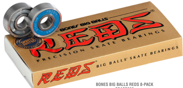
BONES BIG BALLS REDS 8-PACK BSACB888