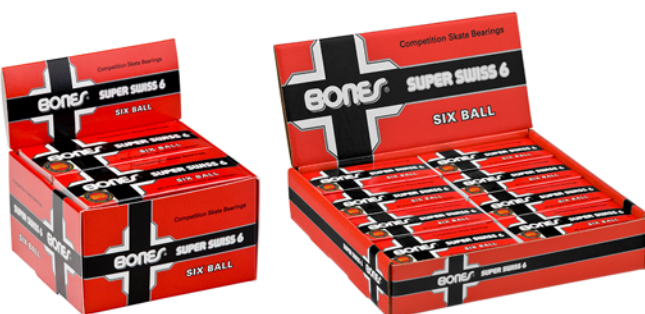
SUPER SWISS SIX 10-PACK POP BSAWBB68P10