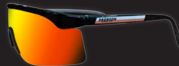
STRIP LOGO SPEED SHADES