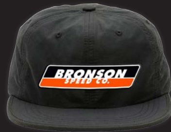
STRIP LOGO DAD HAT