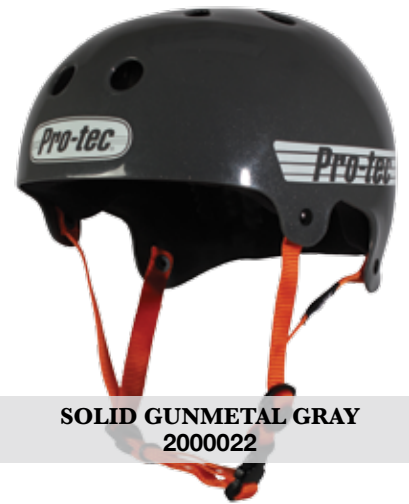
SOLID GUNMETAL GRAY 2000022