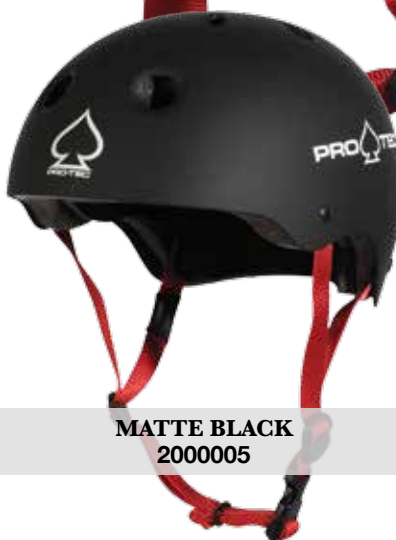
MATTE BLACK 2000005