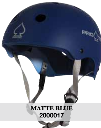
MATTE BLUE 2000017