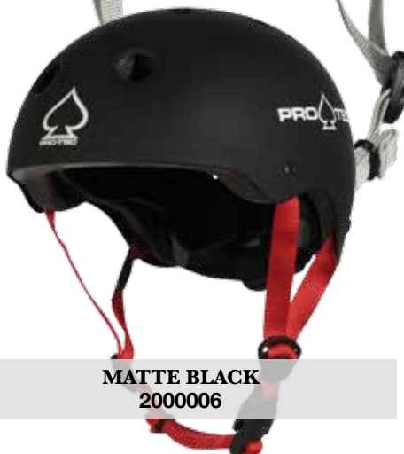
MATTE BLACK 2000006