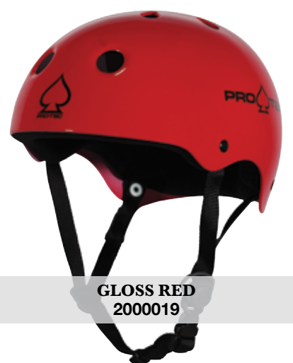
GLOSS RED 2000019