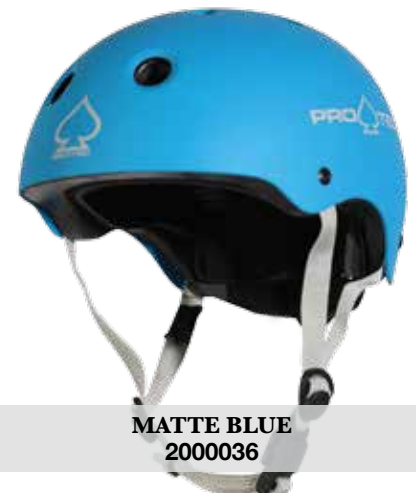
MATTE BLUE 2000036