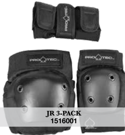
JR 3-PACK 1516001