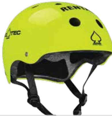
RENTAL CLASSIC SKATE W/ 2-STAGE LINER 1214334

High visibility means you can keep an eye on them. With our signature 375C yellow you can keep those rental pads and helmets coming back to you at the end of the session. Helmet is CE EN 1385 certified. Pads and wristguards are CE certified.