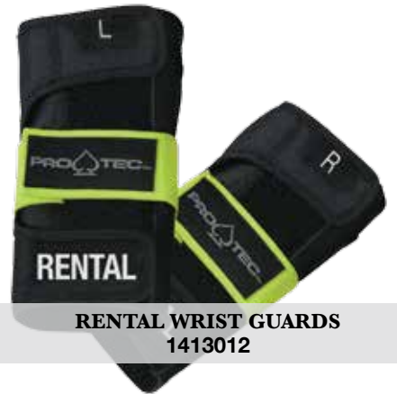
RENTAL WRIST GUARDS 1413012