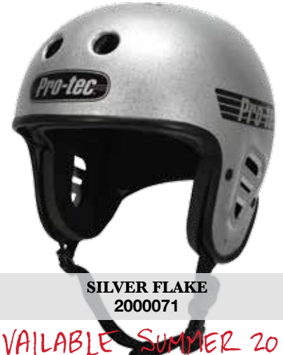
SILVER FLAKE 2000071