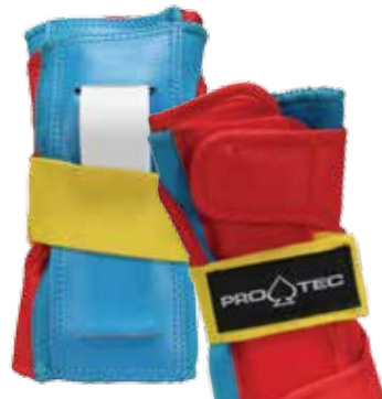
WRIST GUARDS 2000078