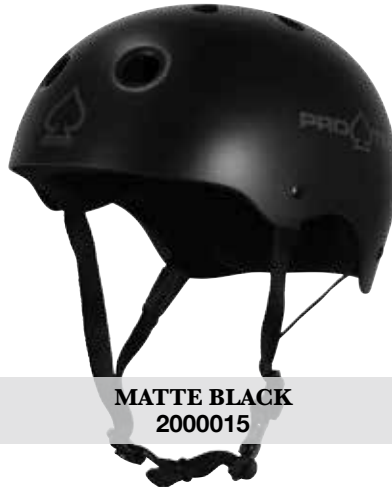
MATTE BLACK 2000015