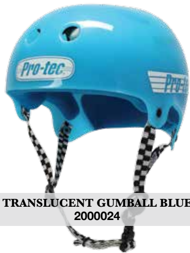
TRANSLUCENT GUMBALL BLUE 2000024