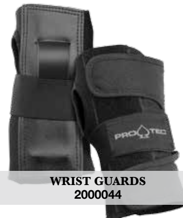
WRIST GUARDS 2000044