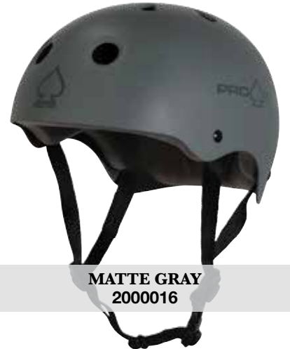
MATTE GRAY 2000016