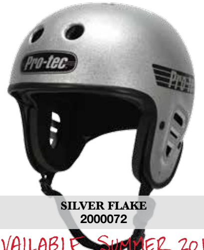
SILVER FLAKE 2000072