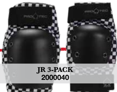
JR 3-PACK 2000040