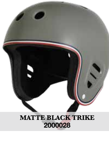
MATTE BLACK TRIKE 2000028