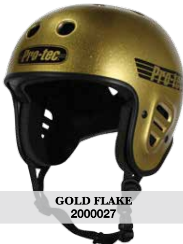
GOLD FLAKE 2000027