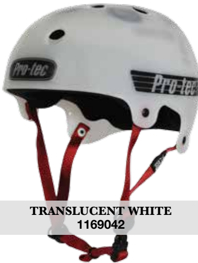
TRANSLUCENT WHITE 1169042