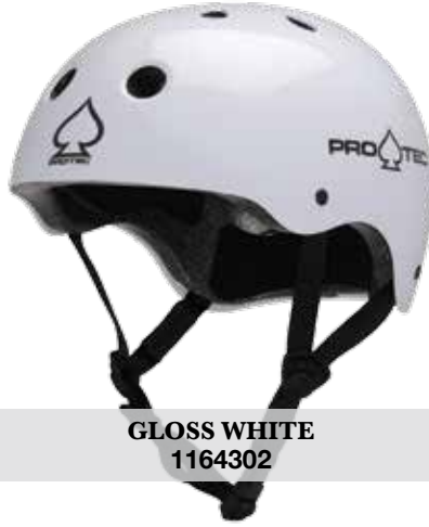
GLOSS WHITE 1164302