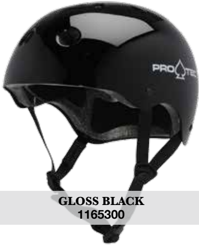
GLOSS BLACK 1165300