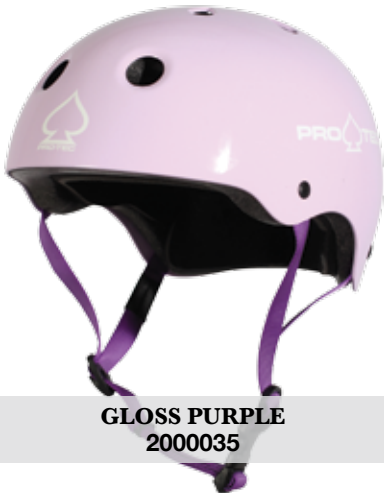
GLOSS PURPLE 2000035