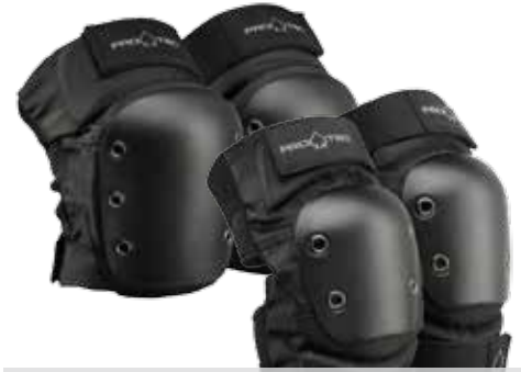
STREET KNEE & ELBOW 1363000