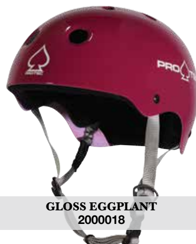
GLOSS EGGPLANT 2000018