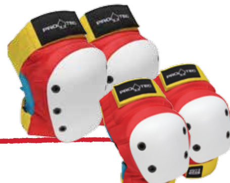
STREET KNEE & ELBOW 2000075