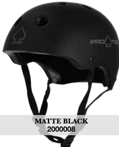
MATTE BLACK 2000008