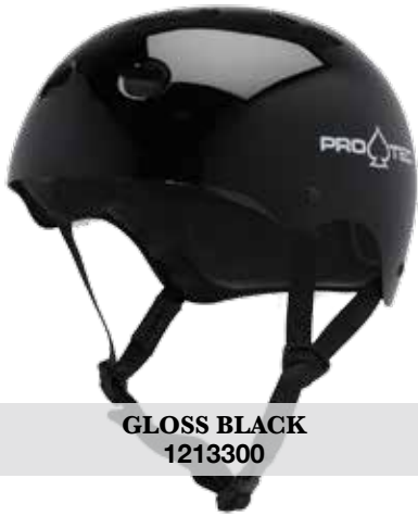
GLOSS BLACK 1213300