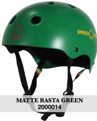
MATTE RASTA GREEN 2000014