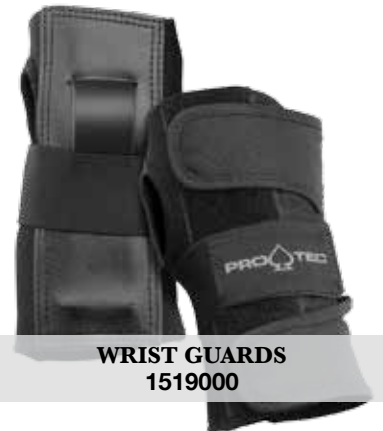
WRIST GUARDS 1519000