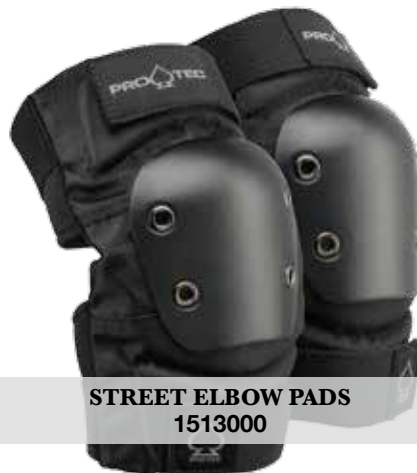
STREET ELBOW PADS 1513000