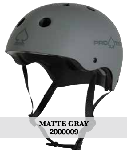
MATTE GRAY 2000009