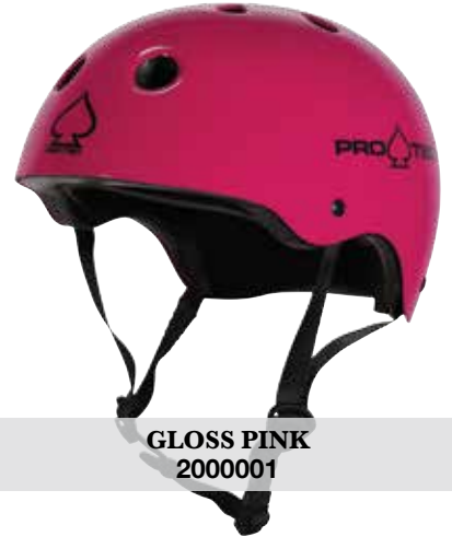
GLOSS PINK 2000001