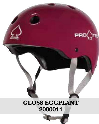
GLOSS EGGPLANT 2000011