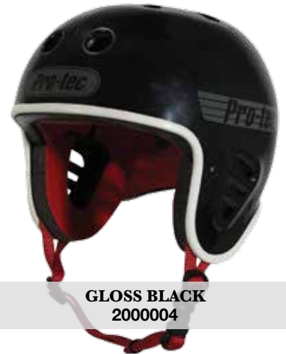
GLOSS BLACK 2000004