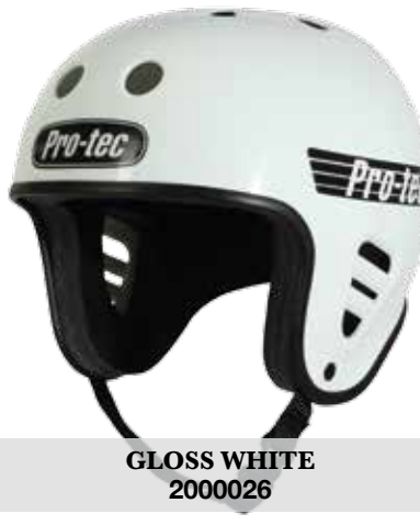
GLOSS WHITE 2000026