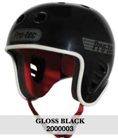
GLOSS BLACK 2000003