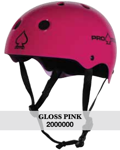
GLOSS PINK 2000000