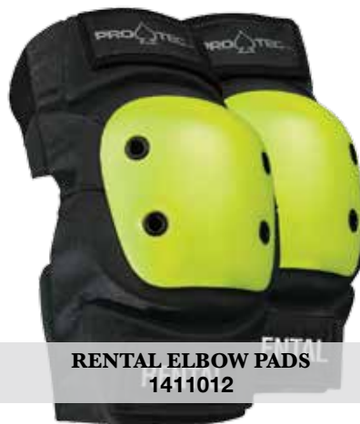
RENTAL ELBOW PADS 1411012