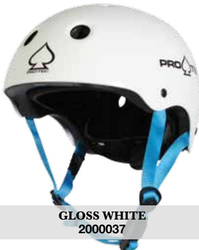
GLOSS WHITE 2000037