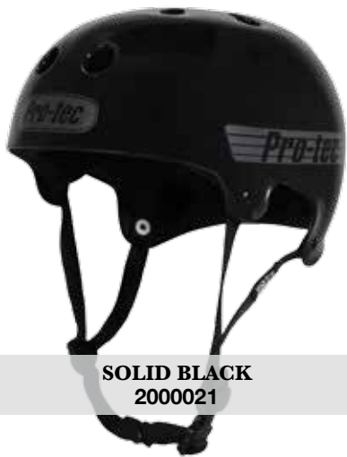
SOLID BLACK 2000021