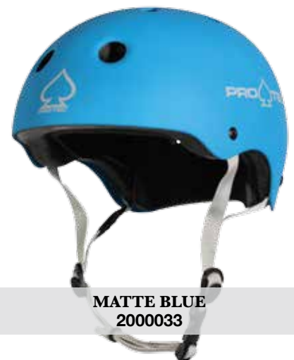
MATTE BLUE 2000033