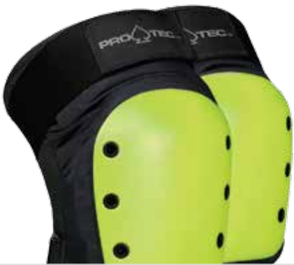
RENTAL KNEE PADS 1412012