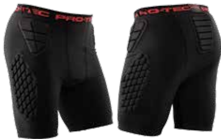
HIP PADS 1375000

Pads and wristguards are CE certified. (excluding hip pads)