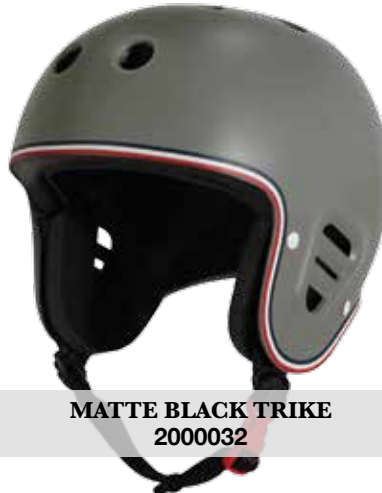
MATTE BLACK TRIKE 2000032