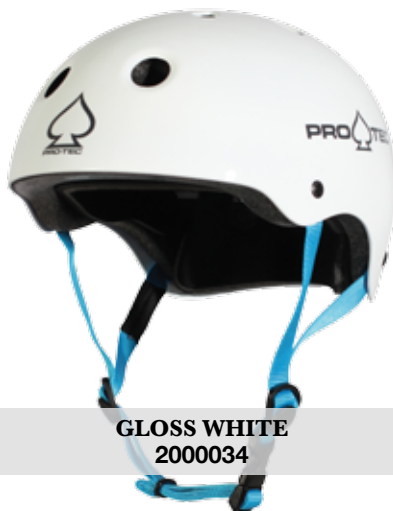
GLOSS WHITE 2000034