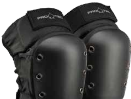
STREET KNEE PADS 1517000