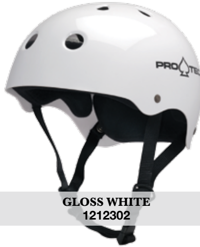
GLOSS WHITE 1212302