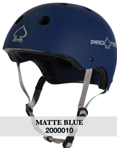
MATTE BLUE 2000010