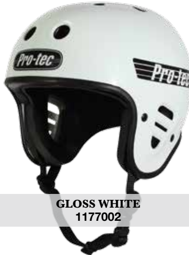
GLOSS WHITE 1177002