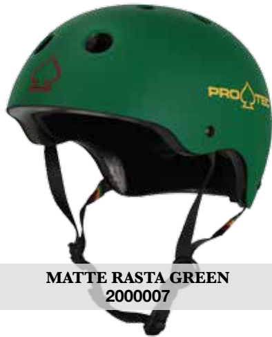
MATTE RASTA GREEN 2000007