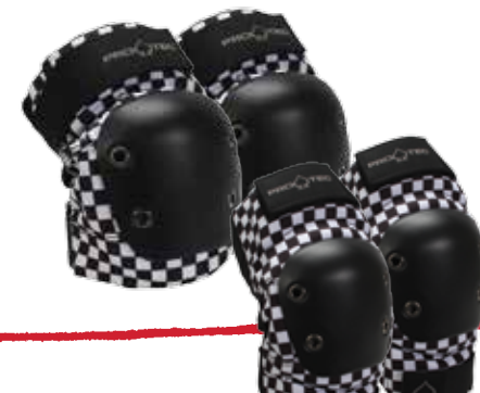
STREET KNEE & ELBOW 2000043