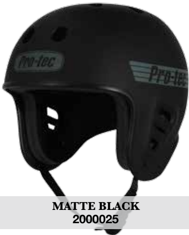
MATTE BLACK 2000025