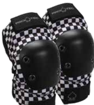
STREET ELBOW PADS 2000042