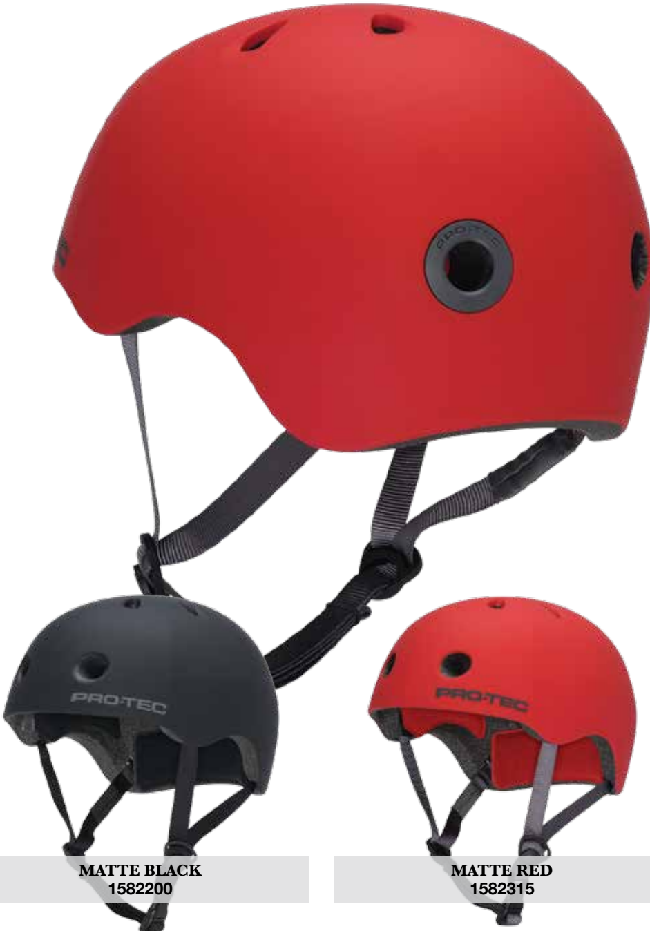
MATTE BLACK 1582200