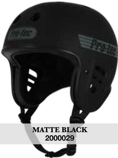
MATTE BLACK 2000029