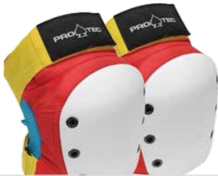
STREET KNEE PADS 2000077