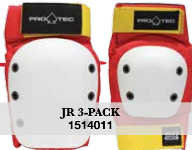
JR 3-PACK 1514011