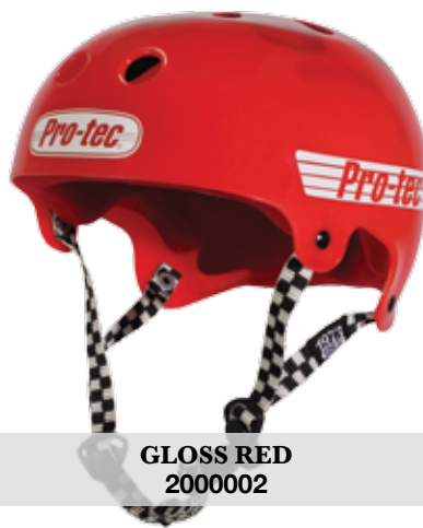
GLOSS RED 2000002