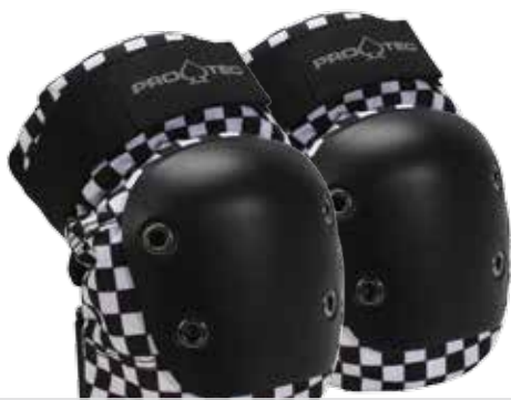
STREET KNEE PADS 2000041