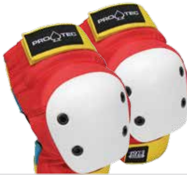
STREET ELBOW PADS 2000076