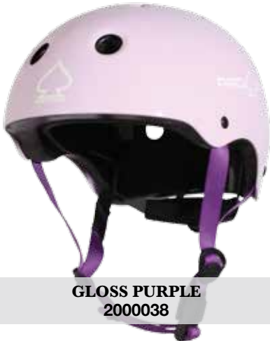
GLOSS PURPLE 2000038