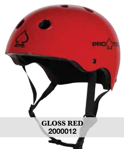
GLOSS RED 2000012